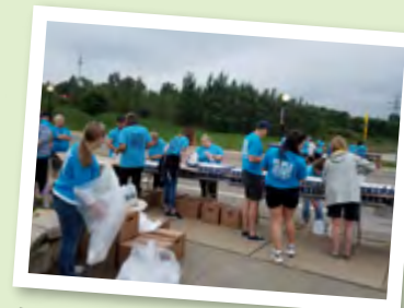
Dort Federal Crim Water Station.