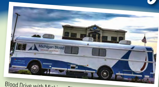
Blood Drive with Michigan Blood